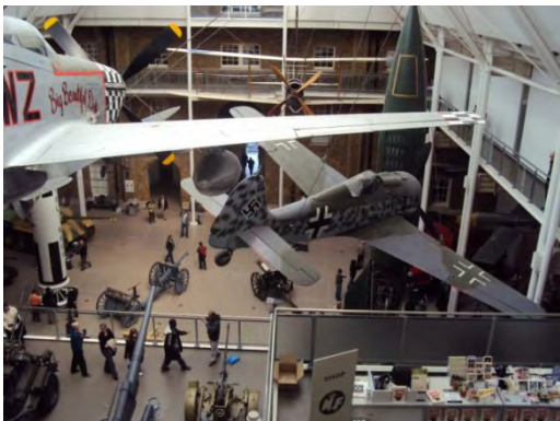
View from the top floor of the museum

The Imperial Museum is a stark reminder of the devastation and sadness of war. It shows how it impacted the world and gave us an insight into what it was like to live during that time in a targeted city like London.