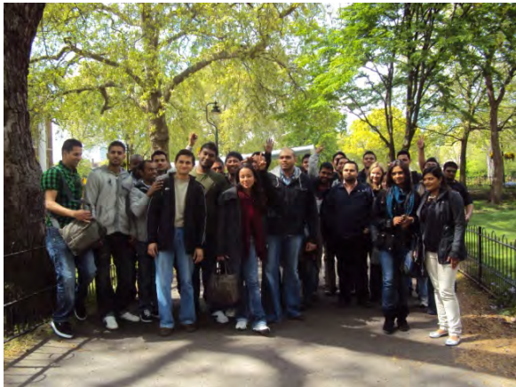
Figure Outside the Imperial War Museum

Many students spent a long time comparing the difference between the German, Russian, British and American tanks. These real relics from the war are featured in the entrance to the museum.