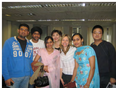
Students at Recruitment Talk