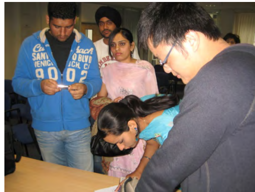
Students give their CVs in for temporary work